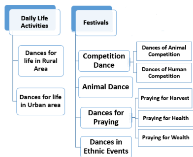
Figure 2. The sub-schema of festival dances and daily life dances

in rural(1) and the dances in urban (2). Dances for rural region depicts the scene of countryside, works on the fields and even the scenes from daily life activities with pasturing buffaloes, fishing and cultivation. In contrast, considering dances for urban areas is the scenes of the modern life to reflect the bad activities from the young generation. It extracts the dark background in the city to admonish their children (the adjacent generations). More importantly, almost all the dances regarding life of urban area is belonged to Kinh ethnic group.