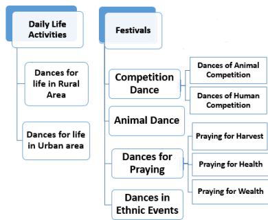
Figure 2. The sub-schema of festival dances and daily life dances

in rural(1) and the dances in urban (2). Dances for rural region depicts the scene of countryside, works on the fields and even the scenes from daily life activities with pasturing buffaloes, fishing and cultivation. In contrast, considering dances for urban areas is the scenes of the modern life to reflect the bad activities from the young generation. It extracts the dark background in the city to admonish their children (the adjacent generations). More importantly, almost all the dances regarding life of urban area is belonged to Kinh ethnic group.